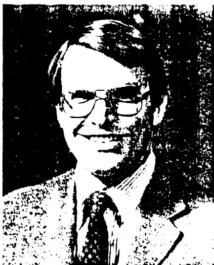
Outsider causes unease