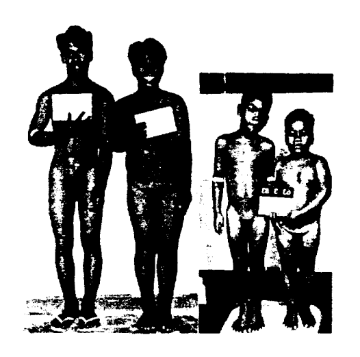
Fig. 4. Right: Subject No. 3 and his younger brother (No. 83) in 1963. Left: Same boys in 1973 after No. 3 had been given thyroid hormone for 8 years.