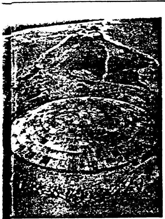
(left) People walking on the concrete dome covering an atomic bomb crater on Runit Island, Enewetak atoll. (below) Nuclear clean up on Runit Island. (left) U.S. Army personnel in full protective gear. (right) Army personnel mixing plutonium-contaminated soil with cement to form the massive concrete dome.